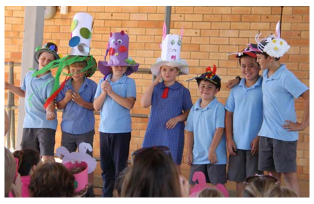
Easter Hat Parade 2018