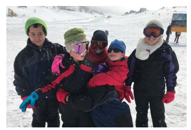
Canberra & Snowy Mountains excursion 2018