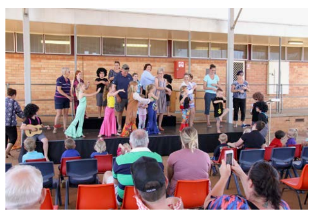
Tooraweenah Public School students K-6 performing at Grandparent's Day 2018