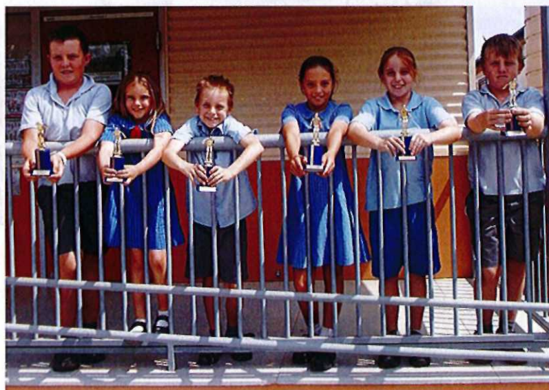
Pictured left – Tooraweenah Public School 2016 Swimming Champions after being presented with their trophies.