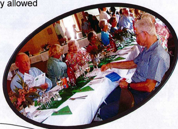
Senior Citizens enjoying their luncheon Students performing for the guests.