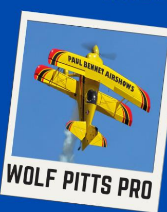
WOLF PITTS PRO