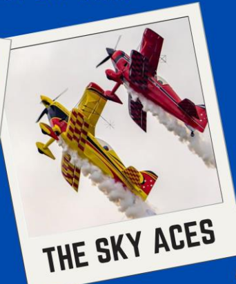
THE SKY ACES