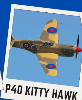
P40 KITTY HAWK